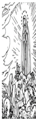
"I am from Heaven."

Leave your mark! According to current research, two in three people want to leave a legacy to a charity in their Will. For many leaving a gift in this way is the greatest opportunity they will ever have to make a significant donation to a cause they really care about. If you value the work Holy Ghost is doing, and would like to see us grow stronger to benefit future generations, you can do so by simply naming Holy Ghost Church in your Will. God Bless you!